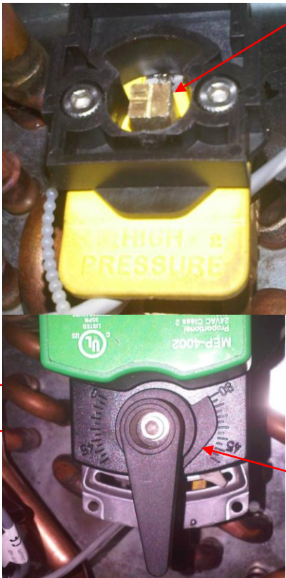
Valve Stem Marking